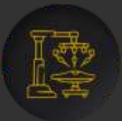
Debates on Robotic Hip and Knee Arthroplasty vs Navigated Hip and Knee Arthroplasty