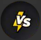
Day Care Arthroplasty Myths vs Reality