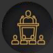
Arthroplasty Sans Frontiers - Invited Guest Lectures by World Leaders and Opinion makers in Arthroplasty