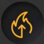
Session on Newer Trends & Future in Arthroplasty