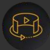
Surgical Video Theatre