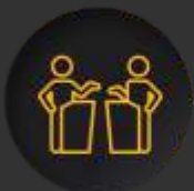
Arthroplasty Battles & Debates