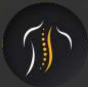
Redefining Spinopelvic balance in Total Hip Arthroplasty