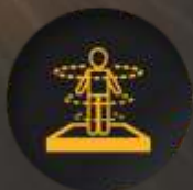
Augmented Reality for TKR Surgeries