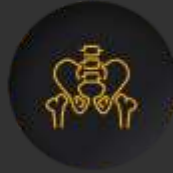
Live Direct Anterior Approach (DAA) Hip