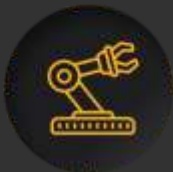
LIVE Robotics in TKR/ UNI