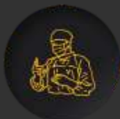
Young Surgeons Forum